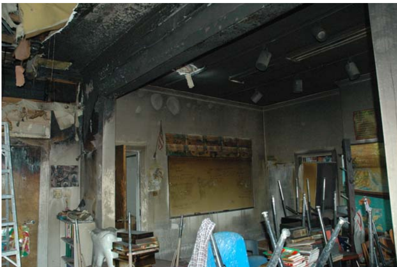
Pat Stanley's Fire Damaged Room

over $1,000! A Girl Scout troupe donated the profits from their cookie sales. On a larger scale, other grants and donations were received to completely renovate the building. All of the classrooms are in wonderful condition, the lower school library received a beautiful facelift, and the lower school computer lab is in a new location. What should have been a tragedy, turned out to bring the community together!