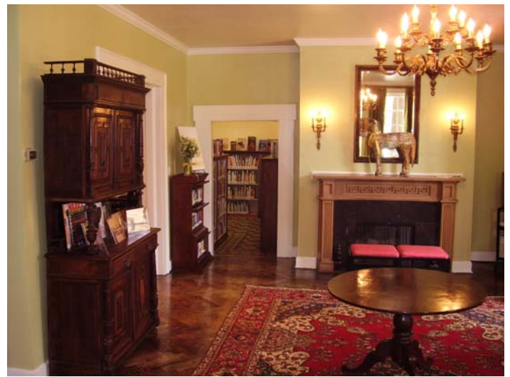
The Newly Renovated Lower School Library